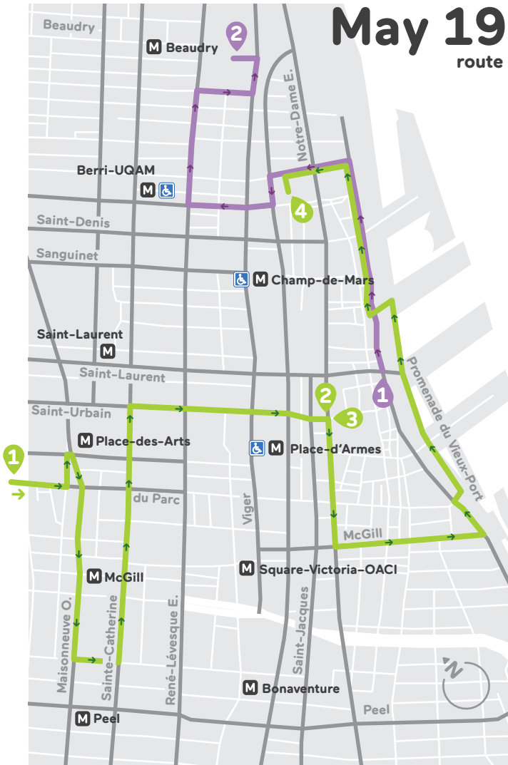
May 19 route

→ By metro, taxi, bus or bike: Either way, let's celebrate the easy way.