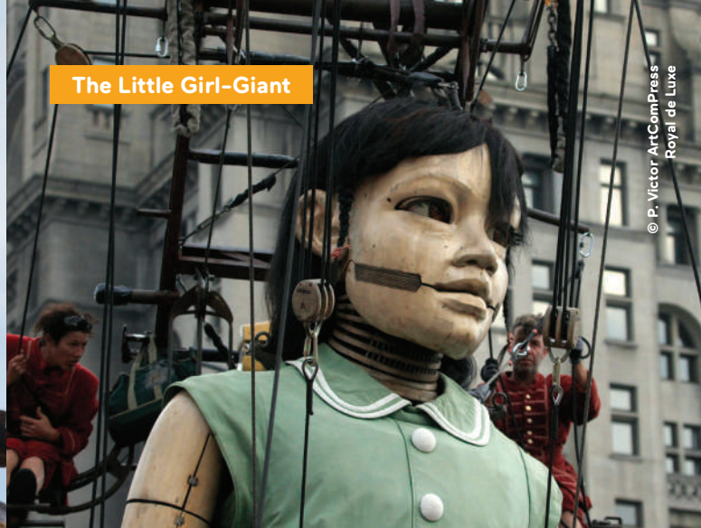
The Little Girl-Giant