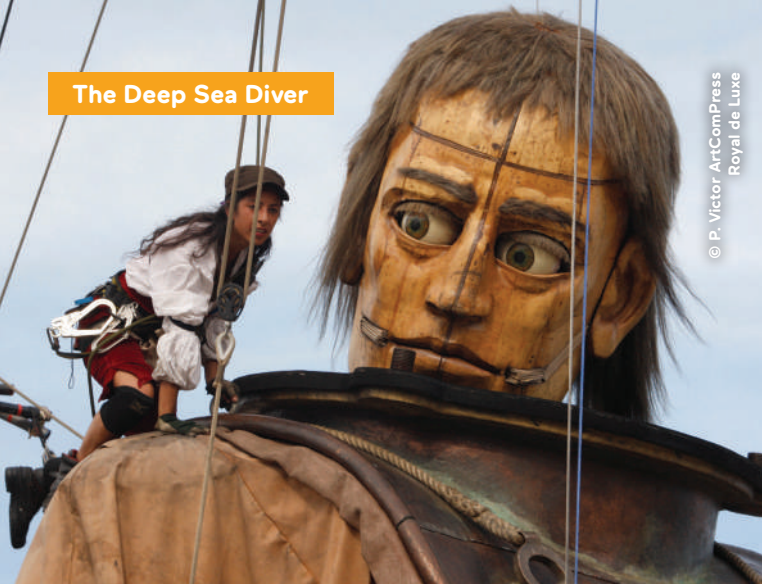
The Deep Sea Diver