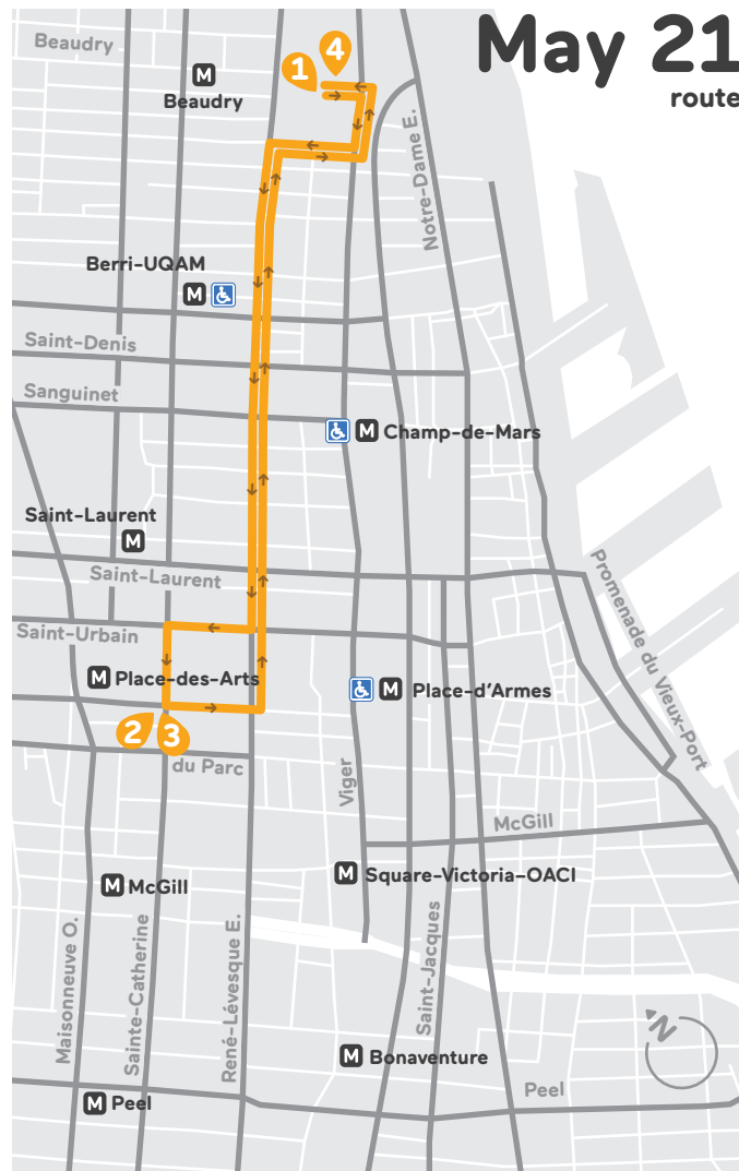
May 21 route